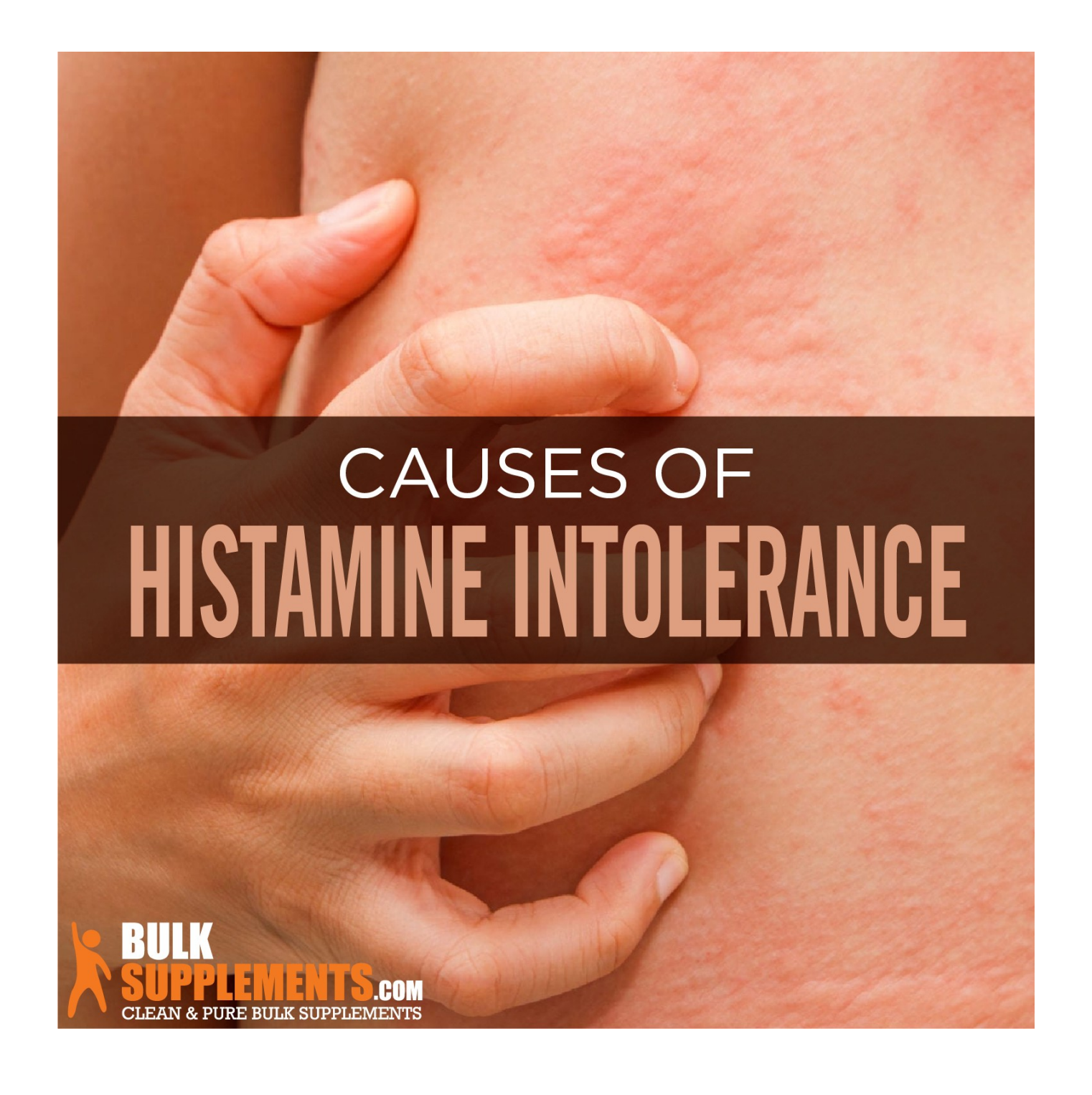
Signs, Causes, And Treatment